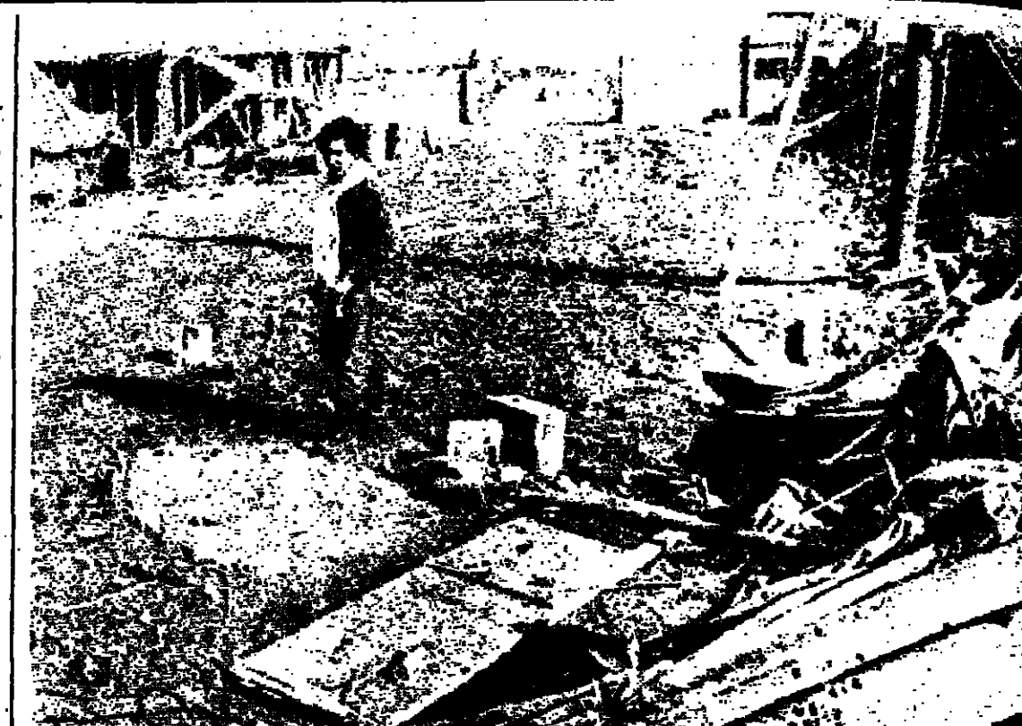
A pro-Arafat PLO man views the destruction in an encampment near Tripoli yesterday that was blasted by Israeli naval vessels late on Friday before dawn.

FRUIT CONTAINERS. — Some $1.5 million has been invested by the Dolev plant, a joint enterprise of Dvir and Lahav kibbutzim, to build an extension to its plastics plant to manufacture containers which can hold 450 kilograms of deciduous fruit (apples and pears.)